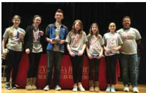
▲ Mayer Middle School students placed first in the Power of the Pen creative writing competition out of 18 other area districts. Several students also went on to place in the regional competition.