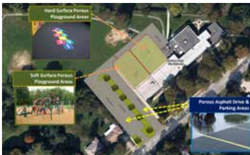
Above Left: The Parkview Early Education Center playground will be relocated and the parking lot expanded.