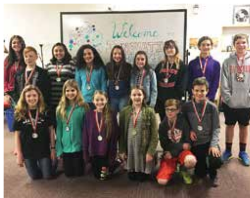
▲ The inaugural Fairview Innovation Challenge took place in May with students from across the district participating in the "Global Day of Design" and accepting the challenge to solve a unique problem from an innovative perspective.