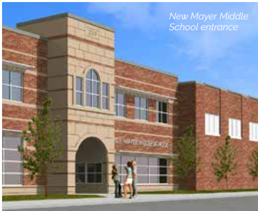
New Mayer Middle School entrance

After the successful passage of Issue 112, the district's combined permanent improvement levy and bond issue in November 2016, the district Facilities Advisory Committee (FAC) moved forward with the selection of the Owner's Representative and Construction Manager-at-Risk for the project. Working closely with the selected architectural firm, The Architectural Vision Group, the FAC, school administrators, teachers, and students, provided input in the needs assessments and planning. With a projected 2020 full completion, the project includes renovations and upgrades to Mayer Middle School, Fairview High School, and Parkview Early Education Center as well as minor updates to Gilles-Sweet Elementary.