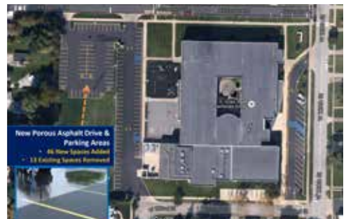
Above Right: Additional parking will be added at Gilles-Sweet Elementary.